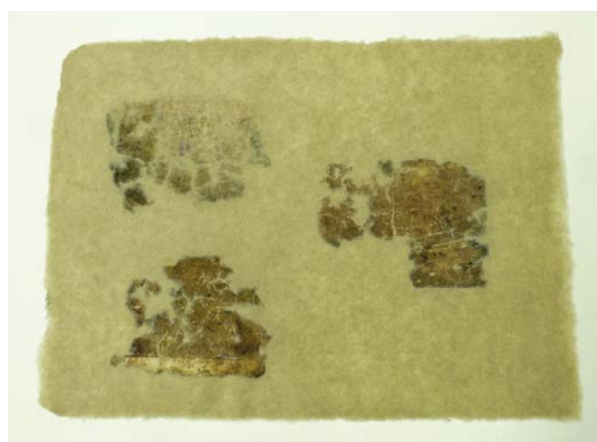
Cast 4. Paste downs and fly leaf.

Casts 3 and 4 required differently toned fiber and a small deckle box.