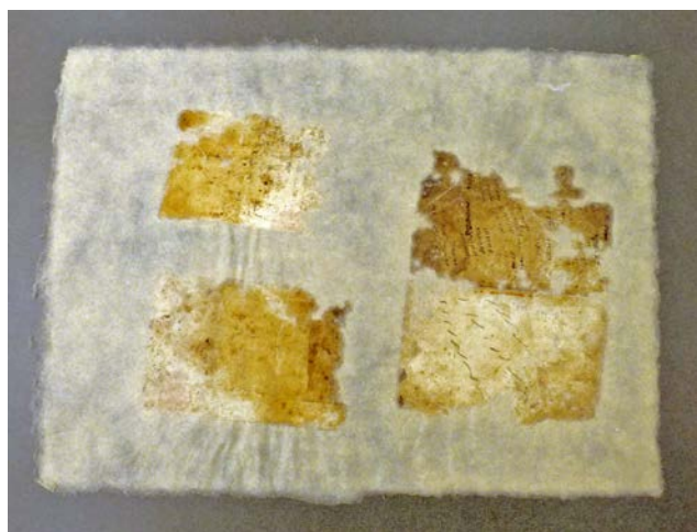
Cast 3. Pages 1-2, 88 and 89.