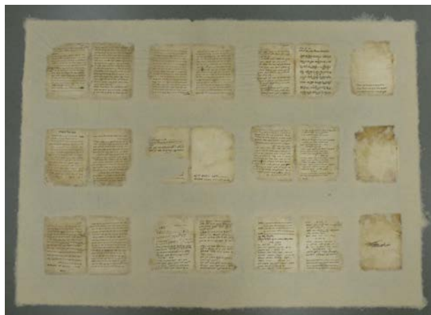
Cast 1. 5592\text{ml} + 10\% = 6150\text{ml} .

Processed a total of 38.25g fiber – 22.95g Mittel II, 15.3g brown kraft - in 12.75L @ 3g/L. Concentration 0.0036".