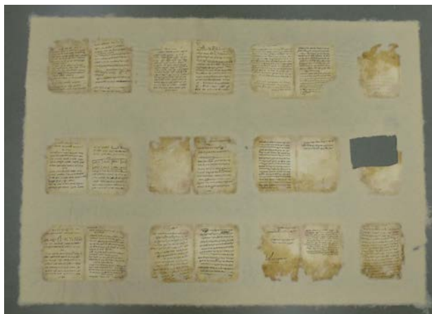
Cast 2. 5755\text{ml} + 10\% = 6330\text{ml} .